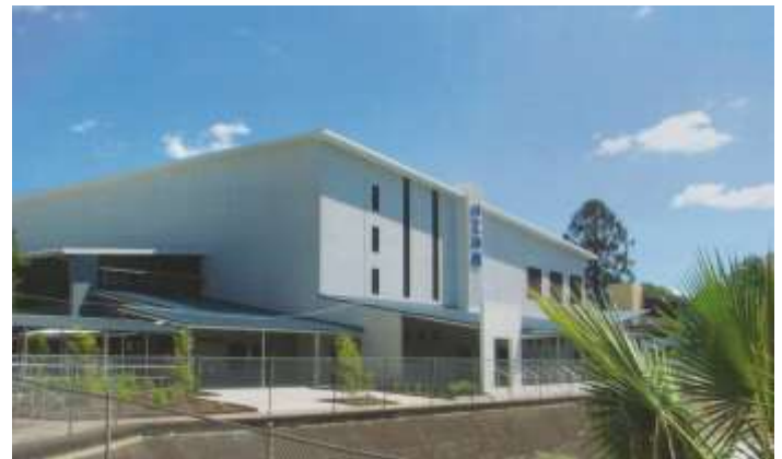
Above - Sports Hall Block "F" - opened in 2007 Left - Classroom Block "I" - opened in 2016