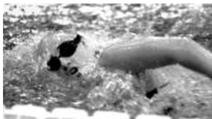
5 Hayley Lewis Class of 1991