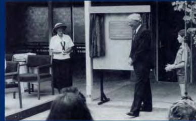
1990: H Block – dating back to 1864 – was restored and opened together with I Block as the Junior School by past student and former Governor-General of Australia The Hon. Bill Hayden AC (Class of 1949).