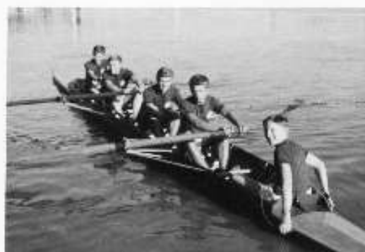
“On the Town Reach in 1960”