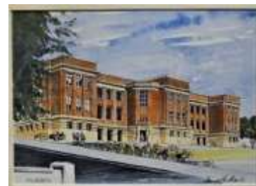
1925 Opening Red Brick Building