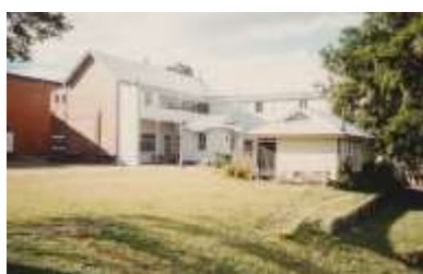
1964 “The Farm” - “H” Block