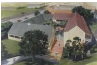
1990 The Junior School “H” and “I” Blocks