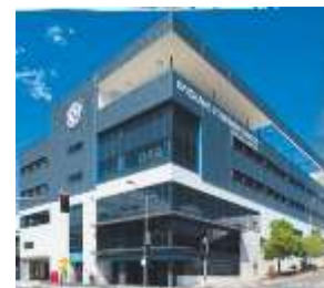
2016 The Kurilpa Building

The first day of school for Brisbane State High School in 1921 was on 4 July in the Normal School , on the corner of Adelaide and Edward Streets.