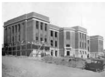
1923 Construction Red Brick Building