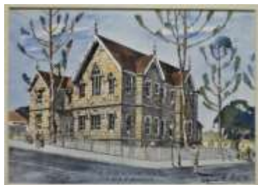
1921 The Normal School